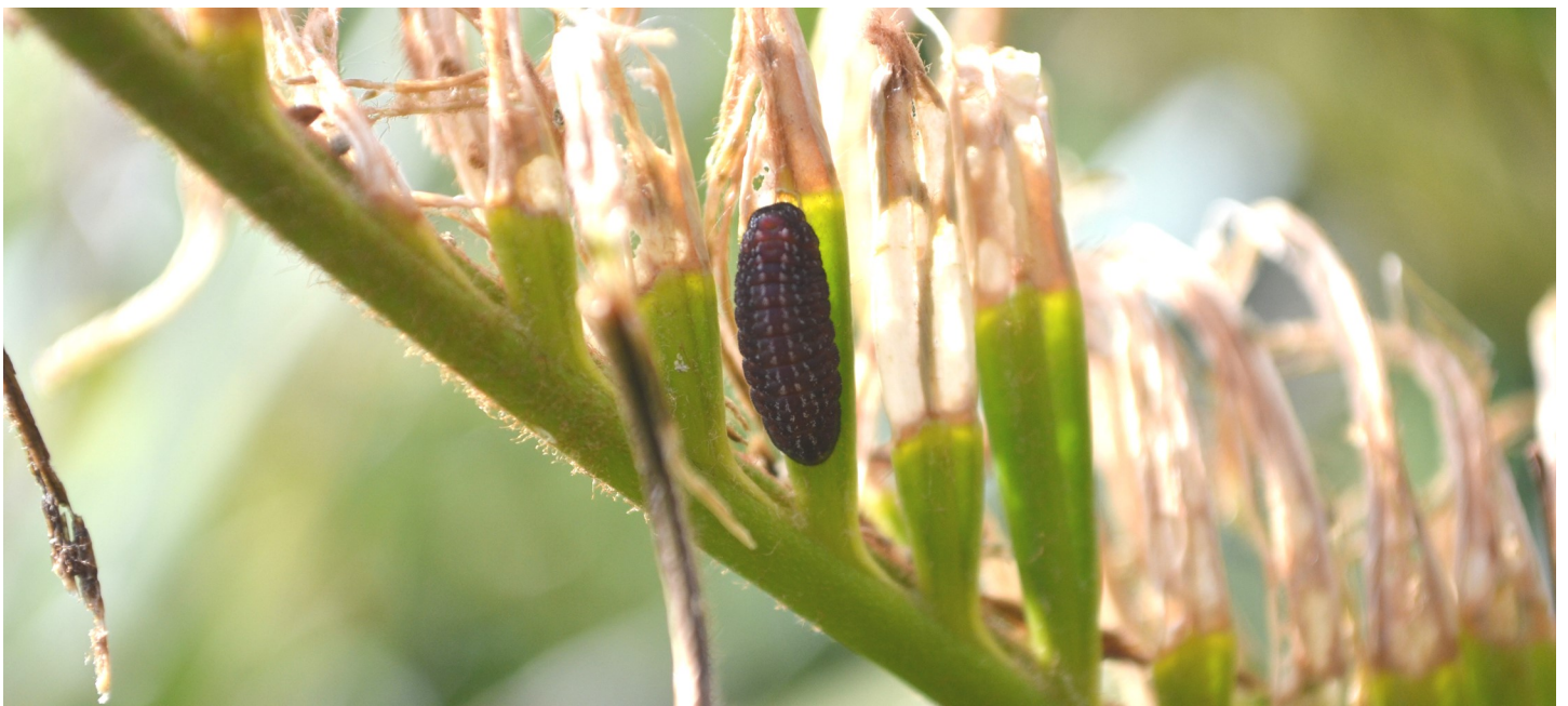
Fig. 2. Underwing of a cycad blue butterfly (above), small, white eggs on new growth (middle) and a caterpillar feeding (below).