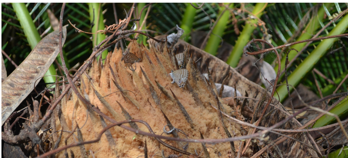
Fig. 6. Cycad blue butterfly laying an egg (bottom-most butterfly).