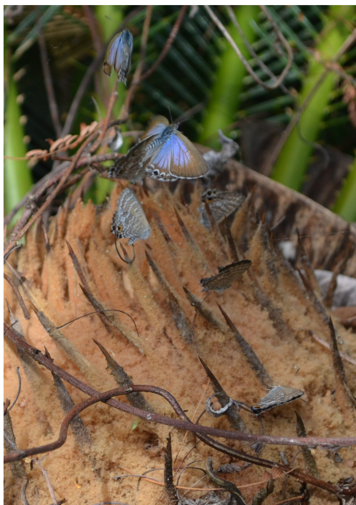
Fig. 5. Cycad blue butter fly flying around a cycad. Eggs have been laid on the apex of the plant even before the flush has begun to occur.

Most of the products listed in Table 1 have contact activity only. This means that the application must be thorough and contact all caterpillars present. There is one systemic product listed, imidacloprid. This active ingredient remains in plant material for about three weeks. However, the concentration may decrease as the leaf expands and therefore application of a different product may still be required. Spinetoram is a translaminar active ingredient, meaning that it moves across the leaf surface. This has the benefit of being more likely to affect caterpillars feeding from within curled up leaves. Bacillus thuringiensis (Bt) is a bacteria that must be ingested by caterpillars. It is best applied when individuals are small; less product must be