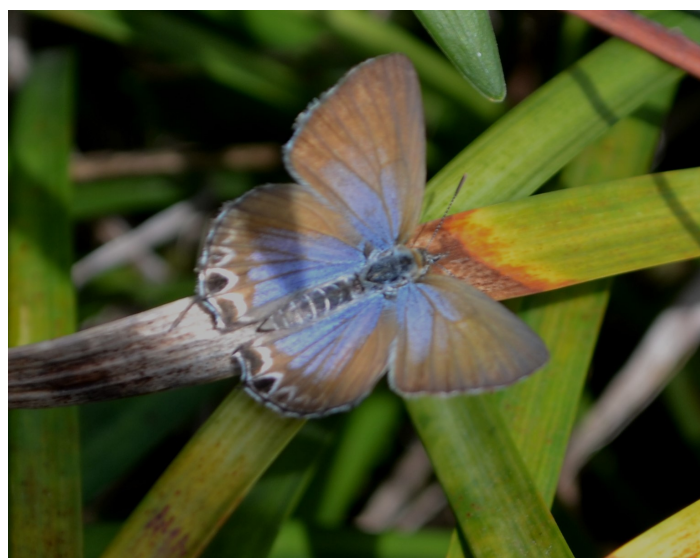
Fig. 1. Variable colouration in cycad blue butterflies on Cycas revoluta in Brisbane.