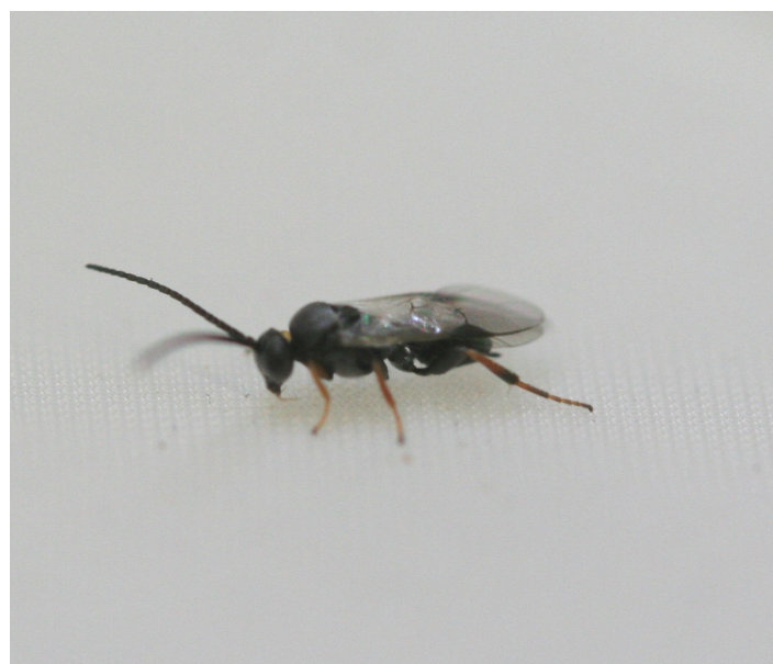
Fig. 2. Pupae exposed from amongst the cycad apex (top), white pupae of a parasitoid wasp and eggs present on larvae (middle), the wasp (about 7mm long) reared from parasitised larvae, Apanteles sp. (below).