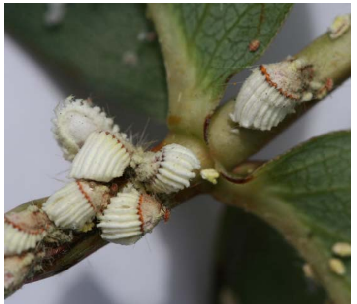
Fig. 4. Soft scales, pink wax scale (top left), soft brown scale (top right - photo by L. Ingram, bugwood.org), black scale (middle left - photo by Central Science Laboratory, Harpenden, Bugwood.org). Hard scales, rose scale (middle right - photo by USDA Agricultural Research Service, bugwood.org) and San Jose scale (bottom right - photo as previous). Cottony cushion scale (bottom right - photo by L. Ingram, bugwood.org).