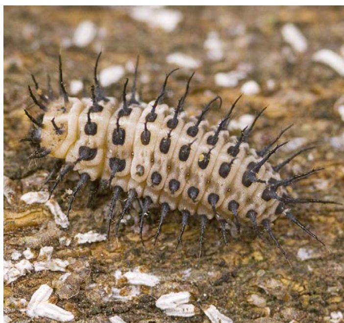
Fig. 6. Aphytis wasp ovipositing into a hard scale (above) and pupae that develop under the scale (insert), Chilocorus ladybeetle (middle) and larva (below). All by Denis Crawford, Graphic Science, except top insert (DAF).