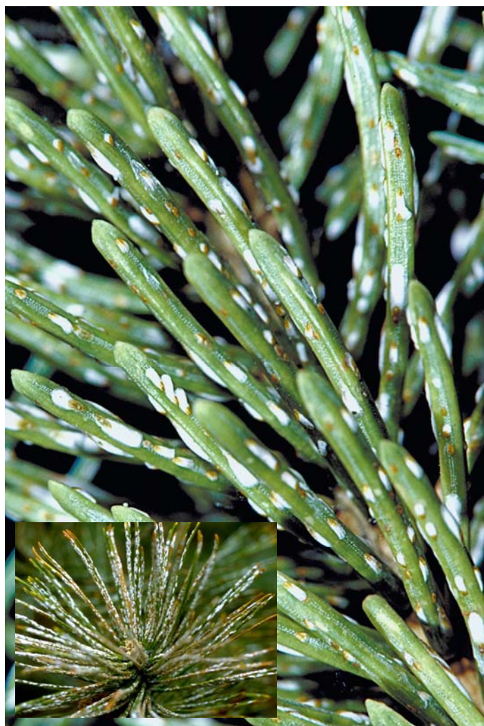
Fig. 1. Pine needle scale ( Chionaspis pinifoliae) close up and dieback symptoms

This factsheet covers the biology of the most common species likely to be encountered in a production nurseries in Australia, (i.e. Coccidae, Margarodidae and Eriococcidae). Refer to the mealybug factsheet at the NGIA website for the biology and management of this group specifically. Management of all scale insects share many common components and is therefore covered once. Additional management strategies and recommendations are made for specific groups, e.g. hard scales, where necessary. This factsheet is necessarily general, providing information typical of each scale insect group; detailed information on each scale species is not possible here. It is recommended to have scales encountered in your nursery identified to facilitate the management of the pest more specifically. Identification is particularly important when the infestation is widespread, when management actions have failed or when they reoccur frequently. Furthermore, some species are serious pests overseas, but are not present in Australia.