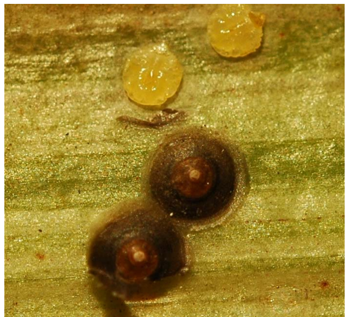
Fig. 2. Saissetia sp. scale insects illustrating female and nymphal individuals (above). Close up of over turned Saissetia female with eggs present under her body (middle) illustrating that the outer covering is connected to its body. Hard scale (below) shows oriental scale with their brown, circular cover and the yellow bodies housed underneath (not connected to the cover).