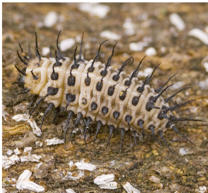
Fig. 6. Aphytis wasp ovipositing into a hard scale (above) and pupae that develop under the scale (insert), Chilocorus ladybeetle (middle) and larva (below).