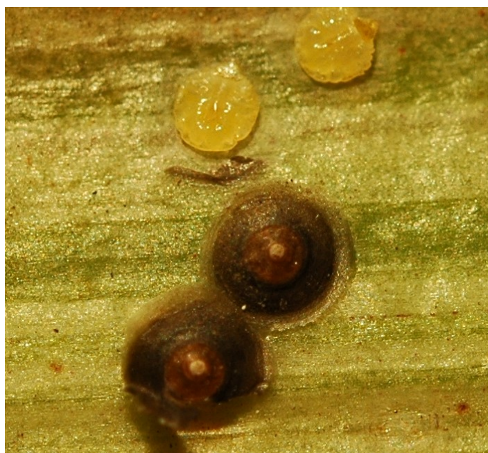
Fig. 2. Saissetia sp. scale insects illustrating female and nymphal individuals (above). Close up of over turned Saissetia female with eggs present under her body (middle) illustrating that the outer covering is connected to its body. Hard scale (below) shows oriental scale with their brown, circular cover and the yellow bodies housed underneath (not connected to the cover).