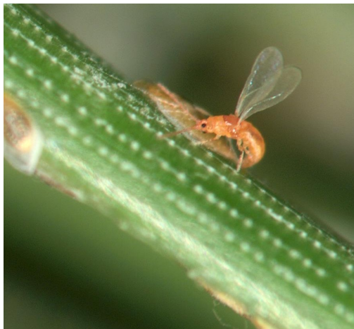
Fig. 3. Male scale insect mating, Photo by L. Graney, Bartlett Tree Experts, Bugwood.org

Hard scales are another very commonly encountered group of scale insects in production nurseries. This group differs from other scale insects in that the waxy 'scale' produced by the insect is not connected to the soft body (see Fig. 2), present underneath the armour. In other words, the scale insect lives underneath a protective cover. In