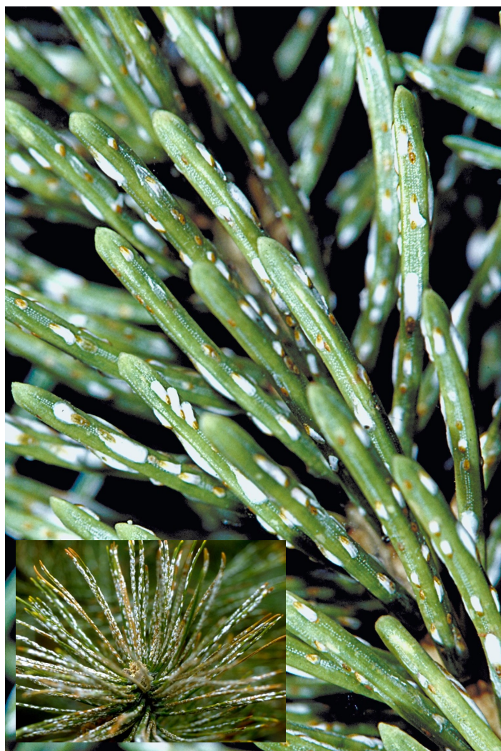
Fig. 1. Pine needle scale ( Chionaspis pinifoliae ) close up and dieback symptoms

All scale insects have a similar basic biology, though exceptions occur. Scale insects are sack-like and often do not have functional legs. The 'scale' refers to a substance secreted over the back of the insect. In most