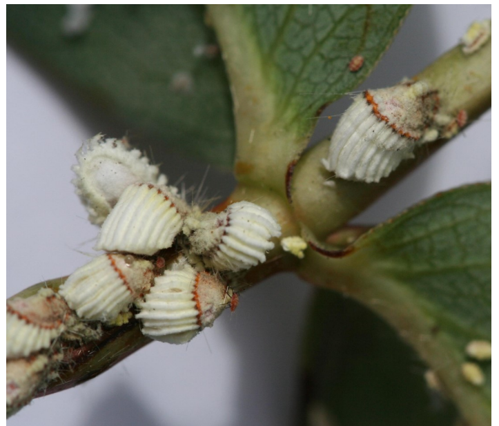
Fig. 4. Soft scales, pink wax scale (top left), soft brown scale (top right - photo by L. Ingram, bugwood.org), black scale (middle left - photo by Central Science Laboratory, Harpenden, Bugwood.org). Hard scales, rose scale (middle right - photo by USDA Agricultural Research Service, bugwood.org) and San Jose scale (bottom right - photo as previous). Cottony cushion scale (bottom right - photo by L. Ingram, bugwood.org).