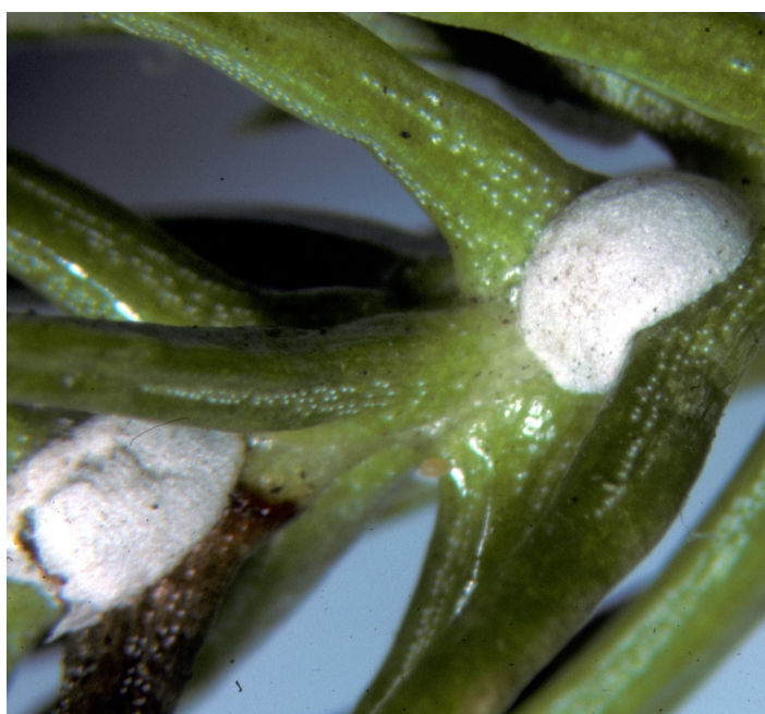
Fig. 5. Eriococcidae, gum tree scale ( Eriococcus coriaceus ) (above - photos by L. Ingram, Bugwood.org) and close-up of E. araucariae (below - photo by USDA ARS, Bugwood.org).