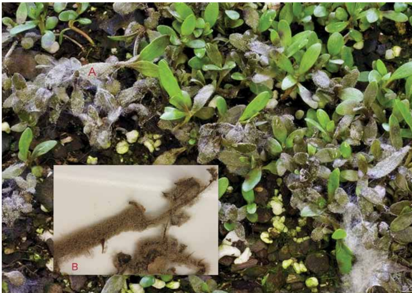
Figure 3: (a) Damping-off in Melaleuca sp. caused by Cylindrocladium sp. (b) Damping-off in seedlings can be caused by a number of different fungi including Botrytis sp. (pictured). Note white fungal growth of Cylindrocladium damping-off (a) in comparison to brownish-grey spore masses of Botrytis sp. (b).

Every precaution must be taken to exclude the pathogens from the production nursery. An integrated nursery management system incorporating strict hygiene, pasteurised growing media, water disinfestation and manipulation of the production environment is crucial in the prevention and management of Cylindrocladium diseases.