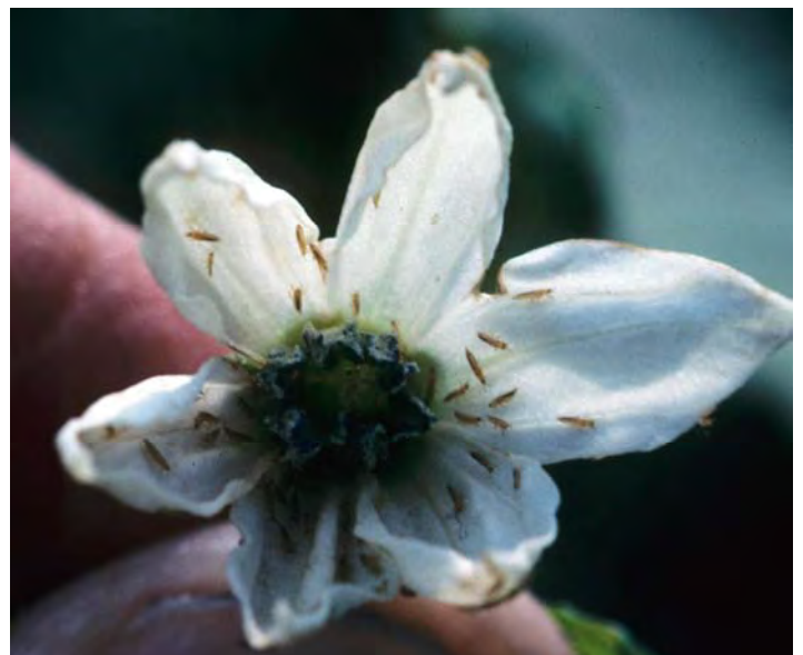
Fig. 4. Leaf stippling caused by WFT (above -); deformed growth from thrips feeding in buds (middle -); damage to capsicum flowers (below -)