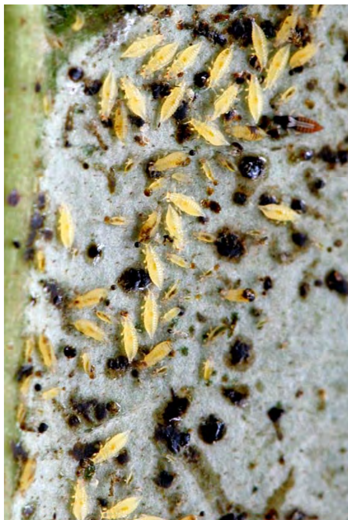
Fig. 1. Greenhouse thrips infestation including larvae stages and a single adult (top right of image). Also note black excrement.

Since many thrips have significant variation in colouration, it is not possible to identify them based on this trait. Identifying thrips in the field is extremely difficult and can only be carried out by an experienced diagnostician with a high powered microscope; in most cases thrips must be slide mounted to be identified to species level. Species