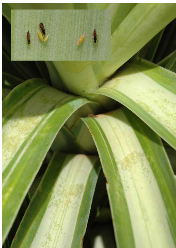
Fig. 6. Some Tubuliferan thrips are also pests. Ficus thrips gall (above); damage from yucca thrips (below) and close up of thrips under leaf sheath (insert).