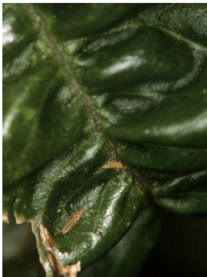
Fig. 3. Typical leaf scarring from thrips feeding (above); leaf puckering caused by thrips (below).