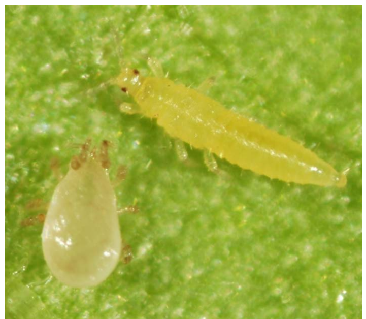
Fig. 5. Montdorensis feeding on a spider mite egg (above); Orius searching for food (middle); Cucumeris next to a thrips larva.