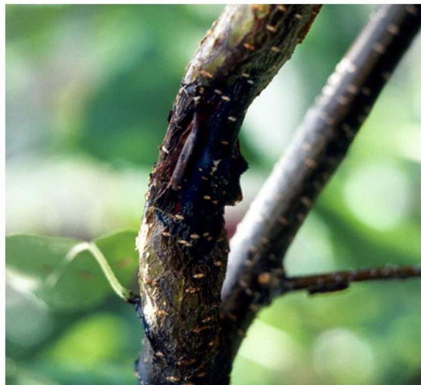
Fig. 3. Leaf blight and shepherds crook on apple (top left -), leaf and twig blight on loquat (top right -), fruit blight on pear (middle left), Rubus tip dieback (middle right -), Stem symptoms (bottom left -) and stem canker (bottom right -).